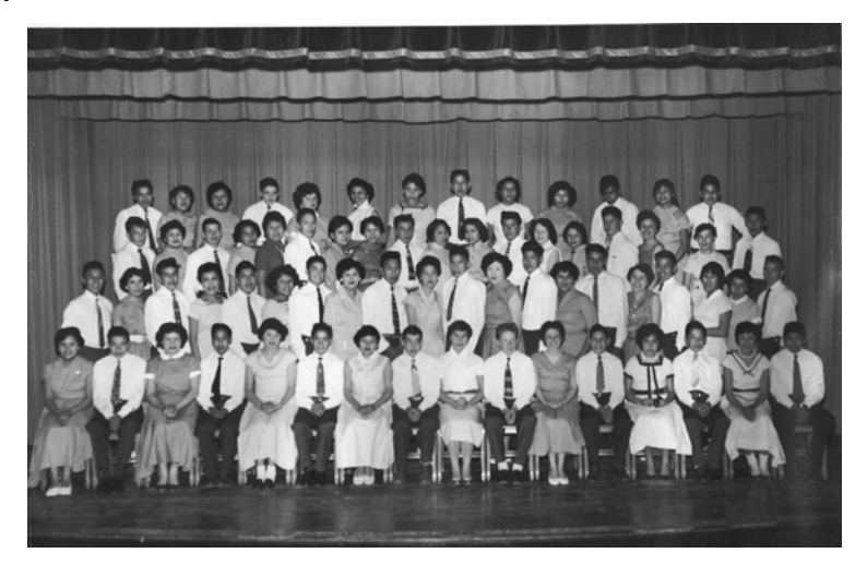
[Wahpeton Indian School Students 1956]

In 1882, a federal act authorized the use of any abandoned military facilities for the education of Indian children. Many Belcourt children were forced into boarding schools at Fort Totten and Wahpeton, North Dakota, and Marty, Flandreau and Pierre, South Dakota, Chemawa, Oregon and boarding schools in other states.