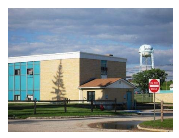
[Turtle Mountain Agency of the BIA, 2007]

protecting water and land rights, developing and maintaining infrastructure and economic development. It oversees about 600 federal employees in the local schools, hospital, road and police departments. (personal communication with Davis 2007)